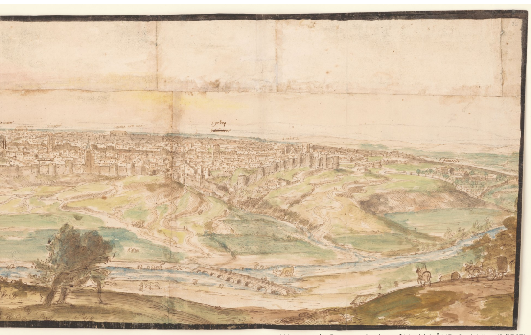
Wyngaerde, Panoramic view of Madrid, ÖNB, Cod. Min, 41 (1563)

In the Madrid - Toledo 2022 International Spring School in Jewish Studies, scholars and students from various places of Jewish belonging will explore the diverse historical questions of exile, belonging and home. We aim at learning about new realms of the Jewish existence and their mutual relationship.